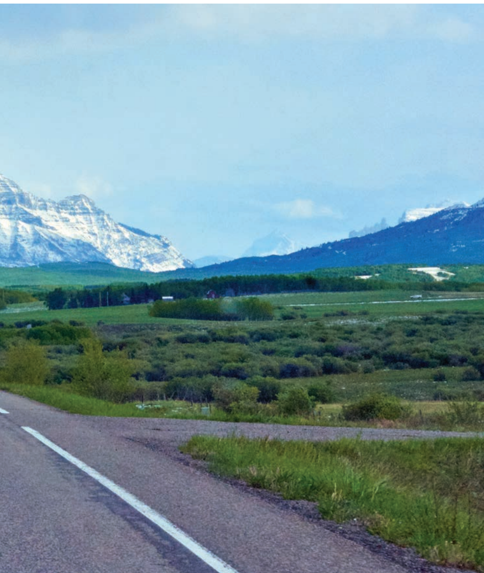
TOP: A scenic view of Canada's legendary Rocky Mountains. LEFT: The Azuridge Estate Hotel. RIGHT: A private helicopter ride for whale watching. BELOW: The pastoral pool at Le Germain Hotel Charlevoix.